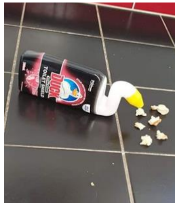
Feeding the duck (Warren Lush)

Traditionally today is a day to be wary, well it is up to midday, but this year the fun of the 1st of April has certainly been ripped out of the day as we prepare to enter week two of lockdown. We sit it out at home, moving our way through the various streaming platforms utilising the free trials the internet offers. Searching for both valuable information and a bit of comic relief to keep our spirits up. This enforced time also gives us all time to reflect on the past. The Club has been doing this, posting daily a photo of times gone past on facebook and viewing numbers are impressive. The Club and greens may be closed but members are still able to interact via the internet and they are certainly doing that as some of the photos in this issue show.