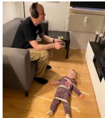
Ensuring the kids are safe.