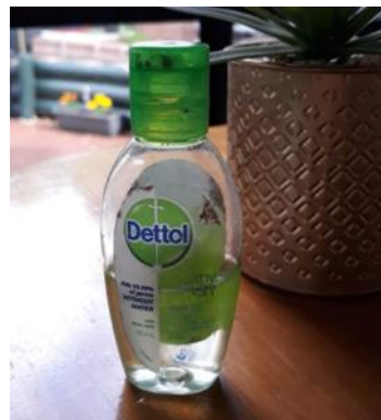
"Don't worry kids. I was cleaning out cupboard, and I found the family fortune".